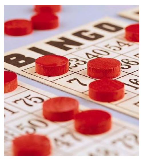
circumstances, may cause the PTA involved to lose its tax-exempt status.

A fundraising activity involving a for-profit business or a game of chance or gambling should be considered carefully before proceeding. The funds raised from these activities may be subject to taxation and, in extreme